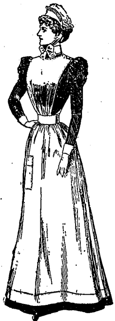
The "Rena" Apron. Made of linen finished Cloth lock-stitch throughout, 2/6 each. In two sizes, 36 in. & 39 in. from waist to hem.

PATTERNS FREE OF THE New Washing Materials for Nurses' Dresses, INCLUDING REGATTA CLOTHS, HECTOR DRILLS, HALIFAX CLOTH, ATTALEA TWILLS, &c.